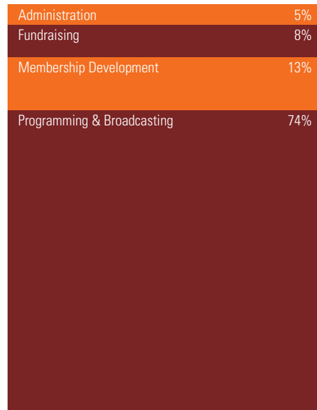
SOURCES OF CHICAGO PUBLIC RADIO OPERATING EXPENDITURES — FISCAL YEAR 2008